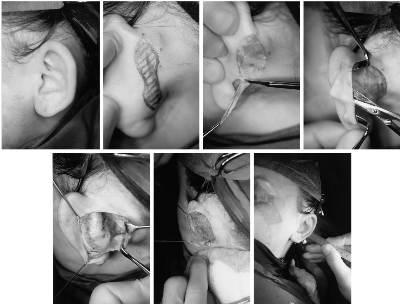
FIG. 1. ( Above, left ) View immediately preoperatively. ( Above, second from left ) The dumbbell-shaped, conservative skin excision is marked. ( Above, second from right ) The dermis and epidermis are excised from the postauricular surface. The subcutaneous tissue and fascia are left on the postauricular surface to be elevated as a fascial flap at a later stage. ( Above, right ) The skin is undermined to the helical rim in the subdermal plane. ( Below, left ) The region of the antihelical fold is marked and the fascia is elevated from the postauricular surface. The free edge follows the curvature of the antihelical fold. The flap is elevated as far medially as the mastoid, thereby allowing plenty of space for the conchal bowl to be rotated medially during placement of concha-mastoid sutures. ( Below, center ) After placement of the Mustardé suture and concha-mastoid sutures, the fascial flap is advanced and sutured to the helical rim, thereby covering the postauricular surface. The excess fascia is then trimmed. ( Below, right ) The immediate postoperative result after closure of the postauricular skin.

tients (31 bilateral, three unilateral). The preoperative protrusion had a mean of 29 mm for both left and right ears (range, 21 to 37 mm for left ears and 20 to 38 mm for right ears).